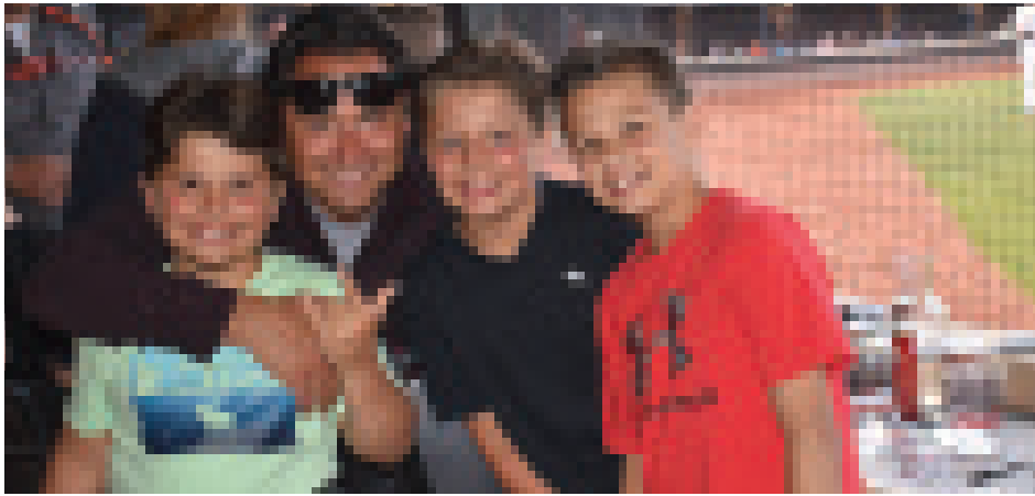
ON FIELD DIAMOND TABLES - FULL SEASON LICENSE (75 GAMES) $20,000

Our 24 premium Diamond Tables offer the perfect environment for entertaining employees and customers. Each half-moon table consists of four premium swivel chairs, inclusive ballpark fare, soft drinks, water, and your own in-seat wait staff. This seating arrangement allows you and your guests to eat drink and socialize while enjoying the game from your own table.