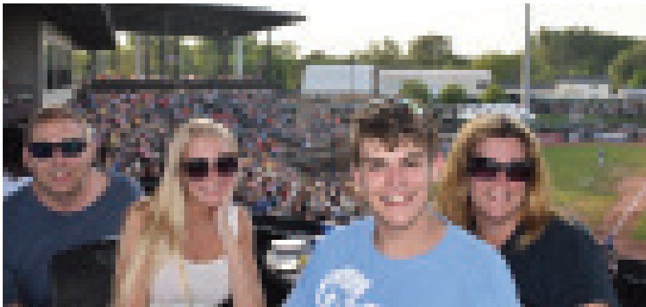
PARK VIEW DIAMOND TABLES - FULL SEASON LICENSE (75 GAMES) $20,000